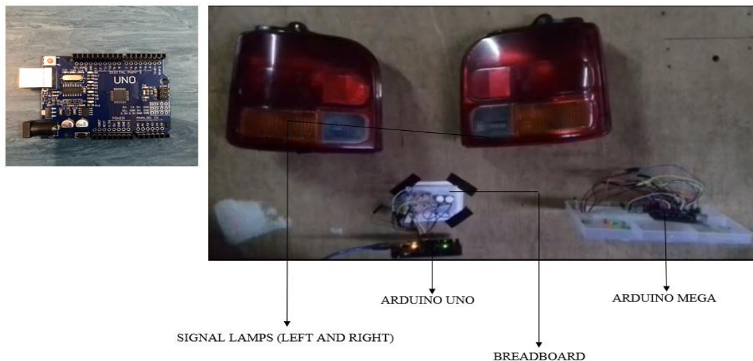
Figure 4 <Arduino Board and Component of Flickering Lamp System>

Arduino is an open source platform used for constructing and programming electronic projects. Arduino consists of both physical programmable circuit board as a microcontroller and piece of software or Integrated Development Environment (IDE) that run on the computer, used to write and upload computer code to the physical board (Arduino, 2015). It contains everything needed to support the microcontroller (Mowad, Fathy, & Hafez, 2014). The Arduino is quite easy to implement control logics on this microcontroller board (Bawa & Patil, 2013). Figure 4 shows the components that have been used to develop the flickering light system.