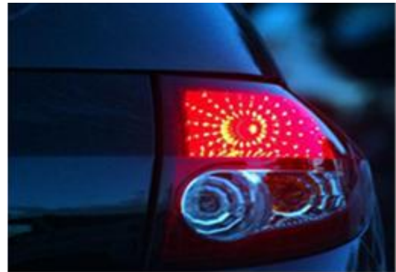
Figure 2 <Indicator Light On the Car Panel and Flickering Brake Light>

Design concept to develop an Alternative Rear Flickering Light System is used Arduino Uno as a parent to a circuit. Figure 3 shown the flow chart to develop of Alternative Rear Flickering Light System.