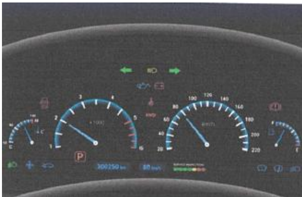
Figure 2 shown how the Arduino work to give an indicator light on control panel is blue color lit and indicates that the signal has been broken. The driver should be alert that the turns signal has been broke and need to turning on the flickering brake light switch. The brake light replacing the broken signal is dimmed when the switch is turned to turn left or right provided by the driver. The other driver must be alert that the blinking of brake lamp is a signal to turns.

This system has been developed consist of the main problems encountered for every driver when the back flickering light is not working. Naturally, the driver didn't realize the flickering turn signal is not function. This can also be a case of road accidents and other drivers may be not aware of the warning given on the headlights.